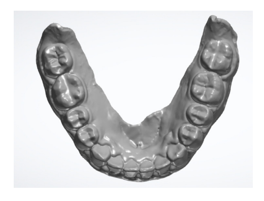
A Good clear occlusal scan