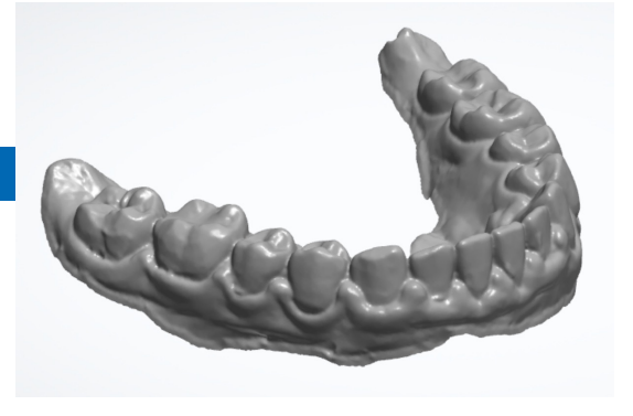
The antagonist scan should be free of distortion or tears