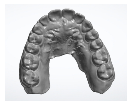
Extend scan behind the second molar in order to secure good retention. Make sure the occlusal table is clear of distortions or tears.