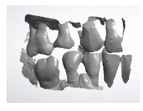
A clear bite scan with minimal points of reference for alignment are required. An anterior section is usually best.

A bite scan is required because when the scan is converted to an STL. file it loses its orientation and may need to be realigned.